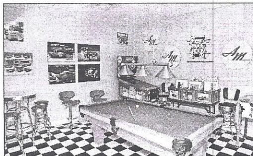
The clubhouse includes a game room with a pool table and pinball machines.