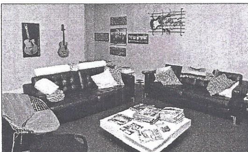
Club members can relax in the private lounge.