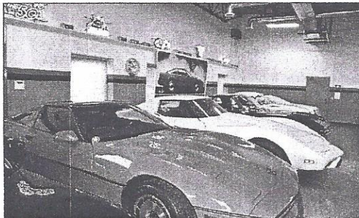
The Woodward Warehouse can house up to 65 vehicles, and is decorated with automobile art, framed automotive posters, and other auto-related memorabilia.

For more information, visit www.woodward-warehouse.com or call (248) 549-7688.