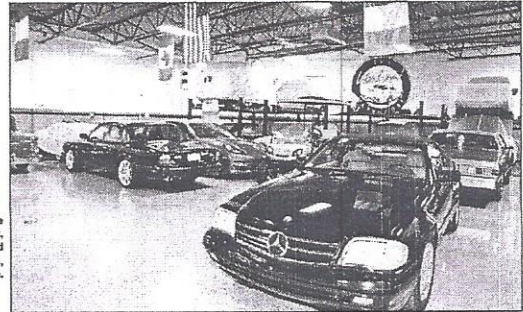
The Woodward Warehouse is a 14,000-square-foot, state-of-the-art climate-controlled storage facility for classic cars, as well as a private clubhouse.